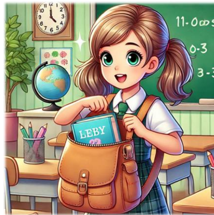
Take out your book