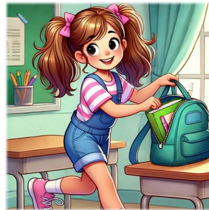
Put away your book