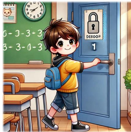
Close the door