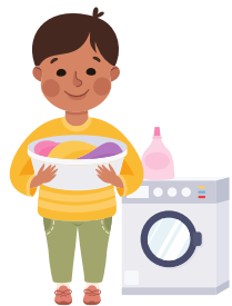
do the laundry