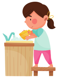
wash the dishes