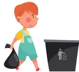
take out the trash