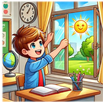
Open the window