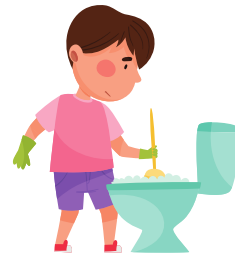
clean the bathroom