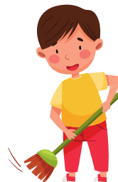
sweep the floor